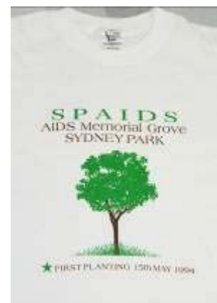
From ALGA's t-shirt collection

The 36th planting of trees in the Sydney Park AIDS Memorial Grove will take place on Sunday 31 July, 11 am till 3 pm. SPAIDS invites you to plant a young Australian tree provided by Sydney City Council's tree nursery to commemorate the life of someone who has died from HIV/AIDS. SPAIDS plantings also include commemorating lesbians, gay men and transgender people who have died as the result of violence. A memorial book listing the names of all 1200 people commemorated since the first plantings on 15 May 1994 will be available at the planting. Further information at http://groups.yahoo.com/group/ozhomohist/message/989