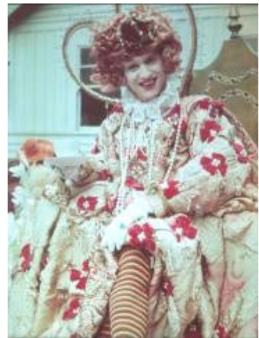
Queen's Birthday picnic 1976