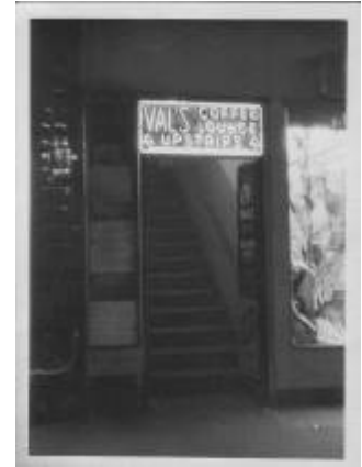
Entrance to Val's early 1950s – Val Eastwood collection, ALGA, photo courtesy Val's estate.

Incidentally, there are copies still available of The travelling mind of Val Eastwood , a collection of short stories by Val published by ALGA in 2009, supplemented by photos from Val's album and a transcript of an interview with Val by Ruth Ford in 1995 (cost $25 or $20 to ALGA members – details on the merchandise page of ALGA's website).