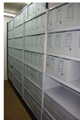
One of eight sides of ALGA's compactus, nearly seven of them now full.

People offering material are encouraged to provide as much detail as possible to assist in assessments of significance and our capacity to store — lists, as ever, are a great help.