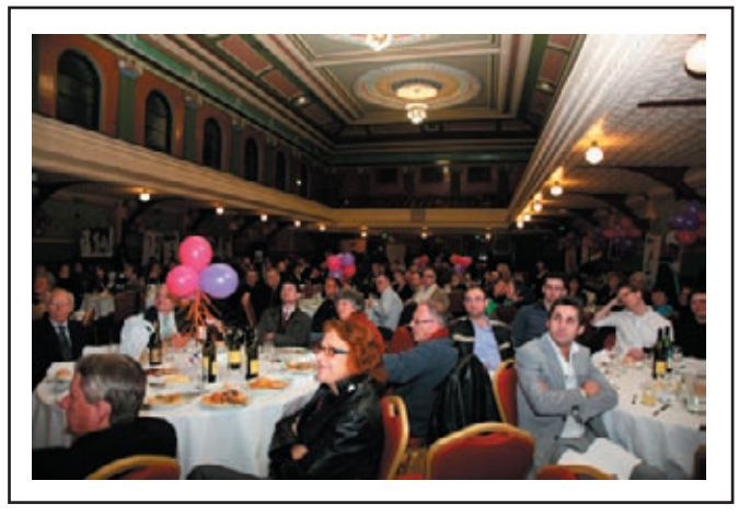
Our Birthday audience, amidst the splendour of the Fitzroy Town Hall.

Next year's Midsumma sees a new addition to the Archives schedule. Think, 'The Amazing Race' but with a queer history slant. Prizes! Fun! History! Stay tuned to the Midsumma guide for more details