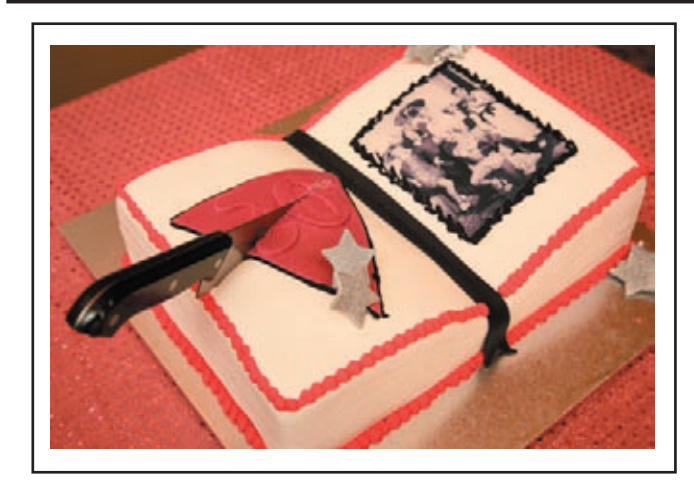
The cutting of our 30th birthday cake.

PO Box 124, Parkville, Vic 3052 Email: algarchives@hotmail.com Newsletter No 25, November 2008 ISSN 1037-3756