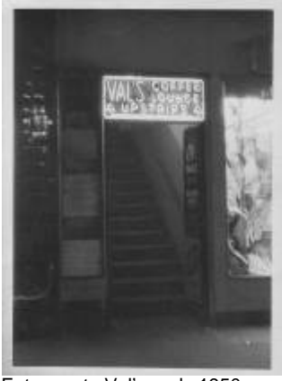
Entrance to Val's early 1950s – Val Eastwood collection, ALGA, photo courtesy Val's estate.

Incidentally, there are copies still available of The travelling mind of Val Eastwood , a collection of short stories by Val published by ALGA in 2009, supplemented by photos from Val's album and a transcript of an interview with Val by Ruth Ford in1995 (cost $25 or $20 to ALGA members – details on the merchandise page of ALGA's website).